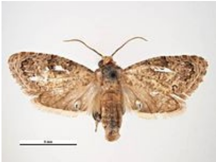
Adult male T. leucotreta

False codling moth, Thaumatotibia leucotreta (formally Cryptophlebia leucotreta ) is a pest that attacks many horticultural crops (peppers, avocado, mango, citrus, macadamia e.t.c) in many parts of the world, especially in Kenya where horticulture is a major economic activity. FCM has been listed by the EC as harmful organisms with many FCM species listed as quarantine pests.