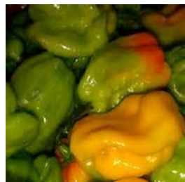
Damage on Pepper