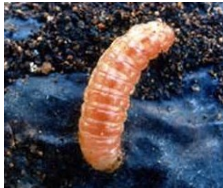
T. leucotreta larvae

The Farmtrack FCM pheromone traps comprise a delta housing, a yellow sticky liner, and a pheromone (in a vial). The pheromone attracts the male T. leucotreta into the delta traps where they stick on the liner. The delta casing/housing protects the sticky liner and the pheromone from environmental factors and related damages. The traps are not only important for control but also in monitoring of pest populations.